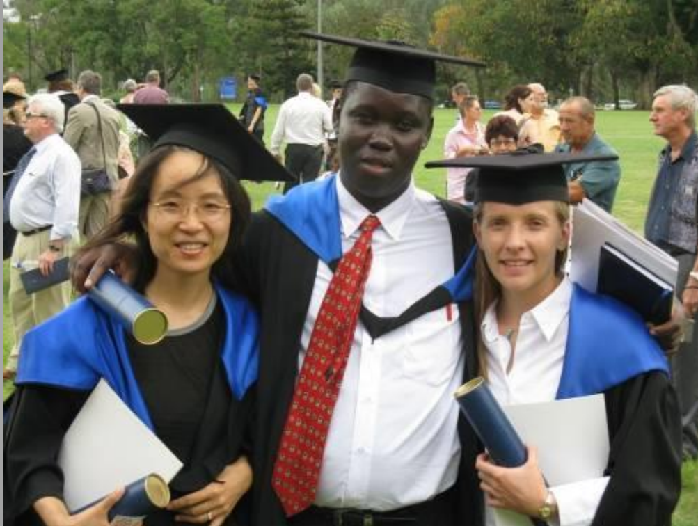
Graduates from Rotary Peace Center at the University of Queensland